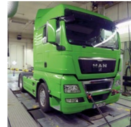
Commercial vehicle end-of-line roller dynamometer

The test options range from break and/or performance tests to testing electronic modules (ABS, ASR ...).