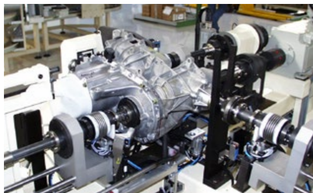
Fully automated transmission test stand