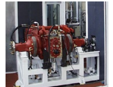
Tractor transmission test stand