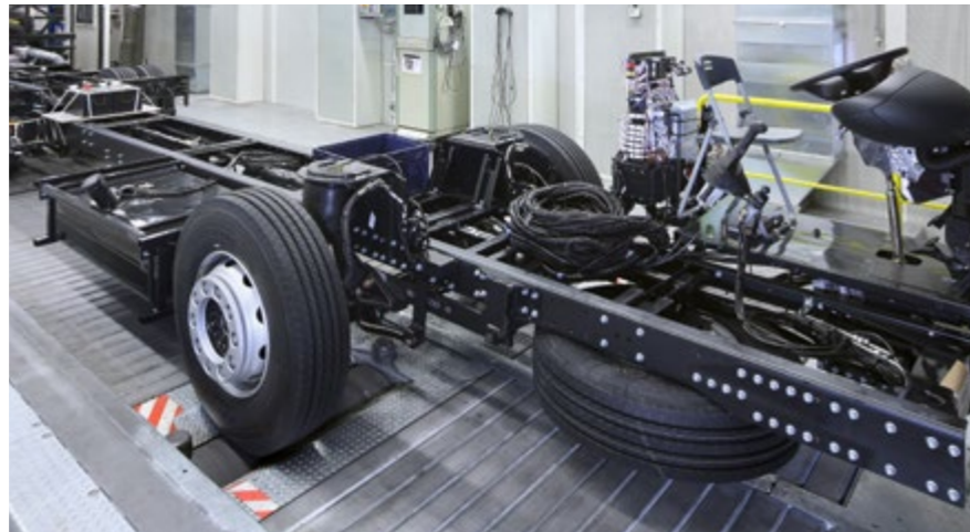
EOL function roller test stand

RENK test stands offer a high level of automation. Depending on requirements, up to fully automatic test operation.