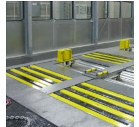
EOL function roller test stand