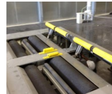
Brake test stand